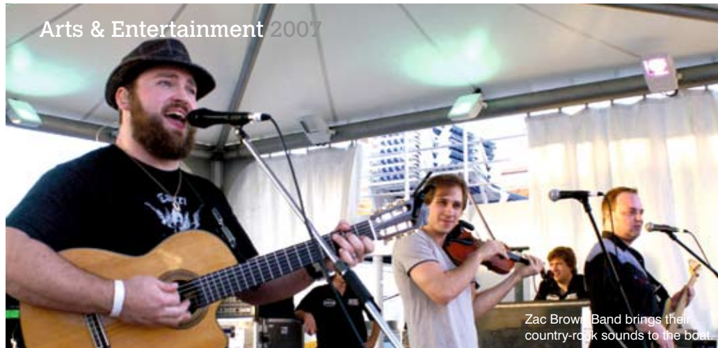
Zac Brown Band brings their country-rock sounds to the boat.