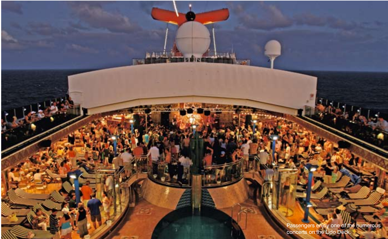
Passengers enjoy one of the numerous concerts on the Lido Deck.